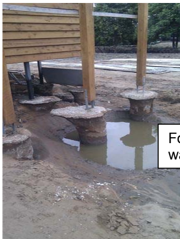
Footings scoured out by fast flowing water

NOTE: Where fast flowing water has impacted on the dwelling, joists and bearers may have shifted/twisted and walls and windows may be out of square etc. Any excessive misalignment should be corrected before new cladding or lining is installed..